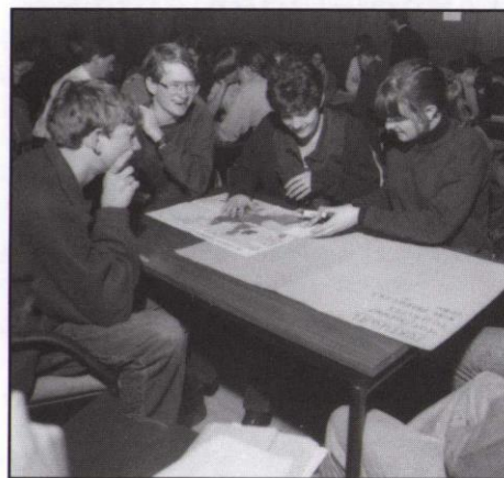
Getting to grips with the problem: Students from Wallingford School plan their market strategy