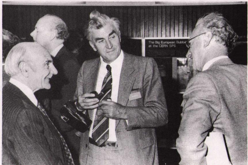
Some of the distinguished guests at the Nimrod commemoration.