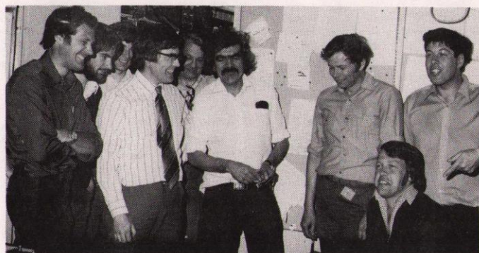
A team from Bristol University and Rutherford were investigating a novel Cerenkov counter design.