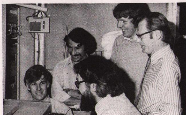
An Oxford University team were checking the ISIS detector destined for use at the CERN SPS.