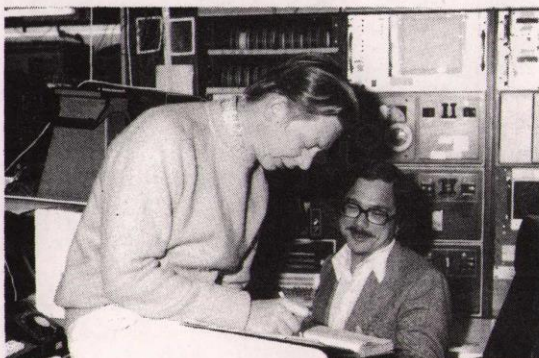
K20 beamline - the main users from Queen Mary College and Rutherford during their final calibration run