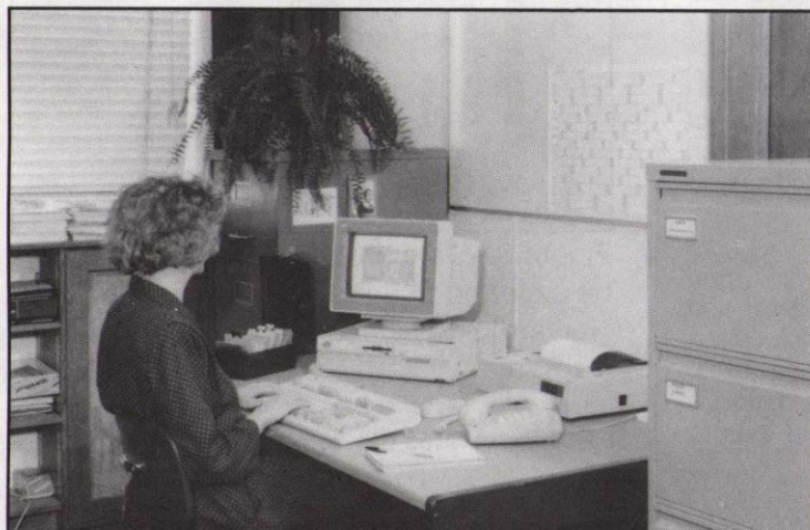
Figure 1. PROFS at work at RAL. A wide variety of users now have access to PROFS using PCs or terminals to link to the IBM mainframe.

PROFS runs on a mainframe computer with each user having access to a terminal or PC linked to the mainframe.